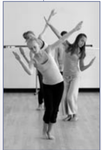
Four Week School class

improvisation, composition, African dance and body conditioning. The program for dancers ages 12-16 focuses on strengthening dance technique and fostering individual creativity.