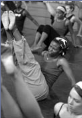
Six Week School class