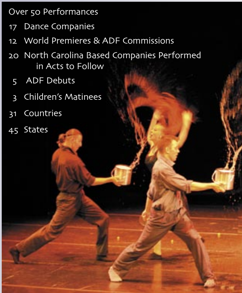
Wings at Tea , Provincial Dances Theatre