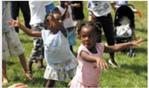
African Dance & Drumming Workshop at Community Day

ADF Project Dance was funded by the National Endowment for the Arts, the Southern Arts Federation and the North Carolina Arts Council. Additional support was received through the Durham Merchants Association Charitable Foundation and the City of Durham.